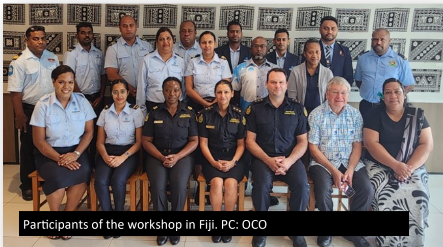
Participants of the workshop in Fiji.

C ustoms officers from across the Pacific were in Fiji in May for a Week of Action as part of a Regional Operation on Trade Risk & Enforcement. Led by the Australian Border Force (ABF) in partnership with the Oceania Customs Organisation (OCO) Secretariat and supported by the New Zealand Customs Service, this initiative aimed to address revenue losses and promote fair trade practices.