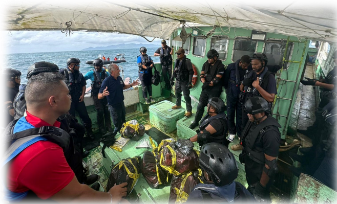
Trainees at the Fijian facility.

T wenty one Customs, Immigration and Fisheries Officers from nine Pacific Island Countries helps to enhance their skills in underway vessel boarding and search methods and improving efforts in combatting Transnational Organised Crimes and Illegal, Unreported and Unregulated fishing. Training was held at the first Pacific Vessel Boarding and Search Training Facility at the Fijian Naval Base in Togalevu, Fiji. This was constructed through the support of JICA and the Global Maritime Crime Programme (GMCP) of the United Nations Office on Drugs and Crime (UNODC) and in partnership with the Fiji Maritime Surveillance and Rescue Coordination Centre (FMSRCC).